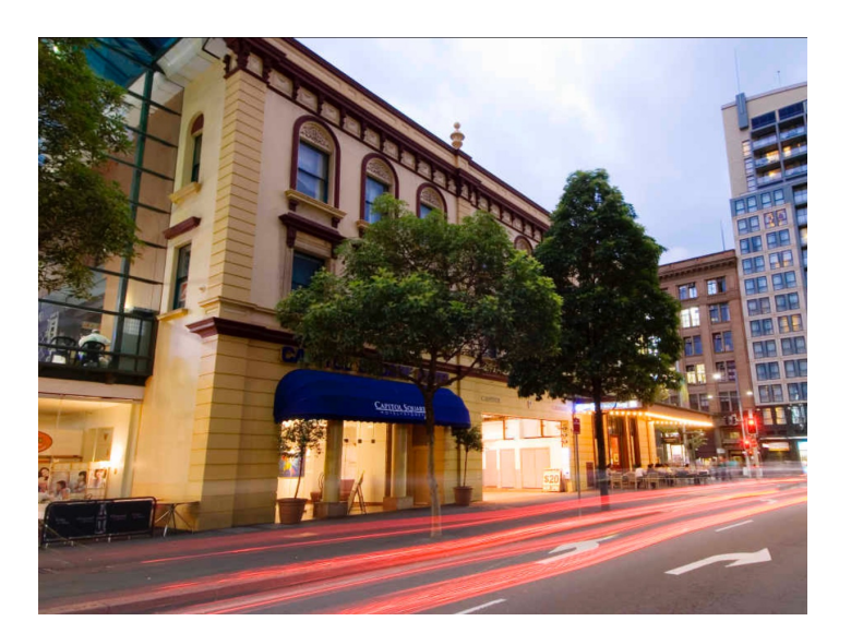
Capitol Square Hotel sold

The City of Sydney's public art initiative "The Garden of Cloud and Stone" that stands front and centre in Haymarket has been recognised at the National Landscape and Architecture Awards. Created by artist Lindy Lee, it was recognised as "an elegant, cleverly curated place for the community". The artwork is based on feng shui principles and comprises a series of pieces: Scholar's Rocks, Moongate and Cloud Gate. Read more