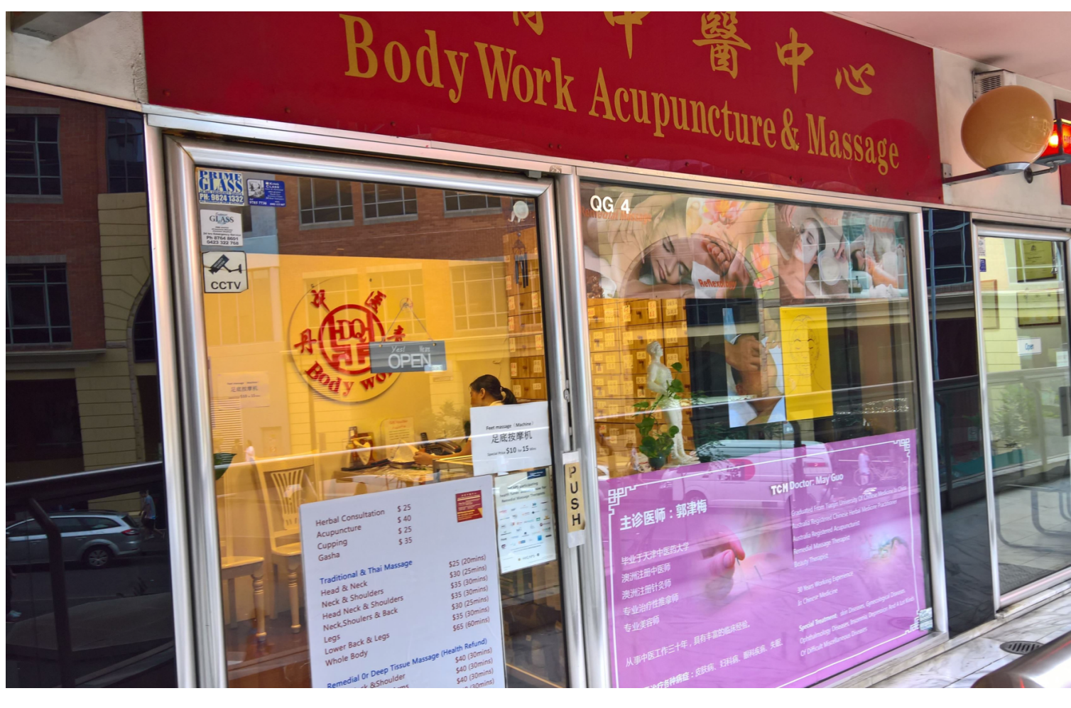
Bodywork Acupuncture and Massage is offering 5% off all treatment and herbal medicines to HCC members. This includes a free initial consultation. <u>More info</u>

Pitt Martin Accountants and Tax Advisers is offering a complimentary one-hour consultation session for HCC members who have been affected by the pandemic. Book now