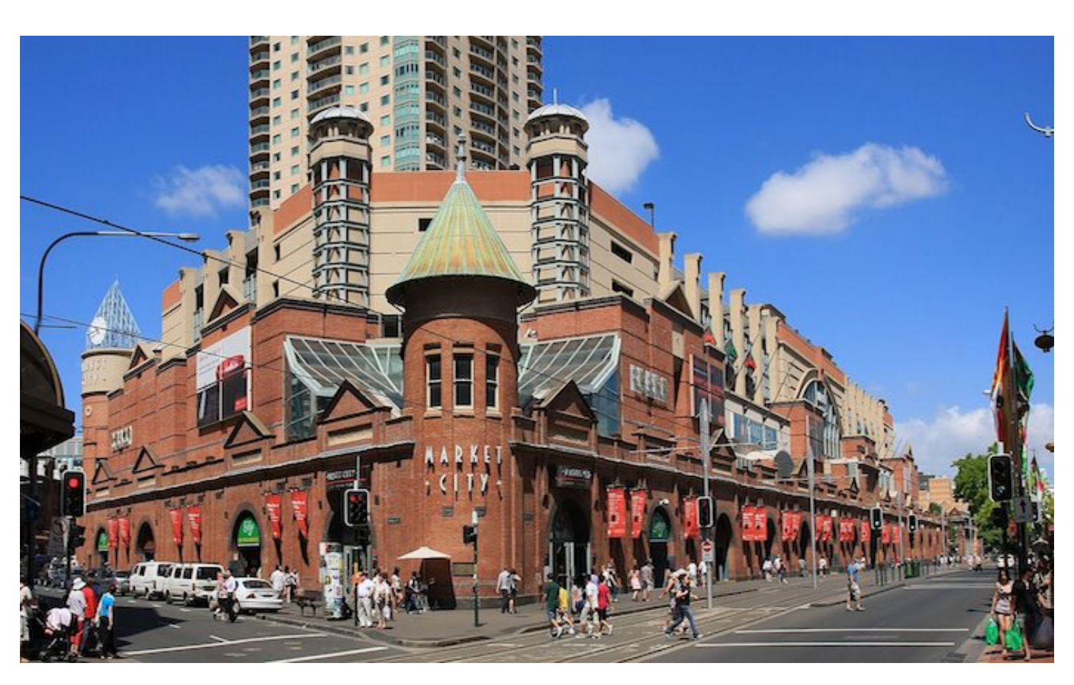
Haymarket is Sydney's "Most Walkable" neighbourhood

Haymarket is "a walker's paradise" according to Walk Score, who recently awarded the area the most walkable neighbourhood in Sydney. "Daily errands do not require a car in Haymarket Sydney." <u>Read more</u>