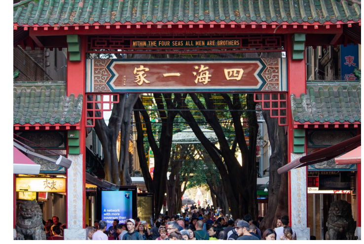
Chinatown mentioned in "Coolest Neighbourhoods"

Chinatown gets a brief mention in TimeOut's "World's Coolest Neighbourhoods" piece. "Sydney can be a pretty tribal city, with specific 'hoods defined by their cultural niches: China Town in Haymarket, Little Italy in Leichhardt, the backpacker bubble in Bondi, the gay village on Oxford Street." TimeOut awarded inner-west suburb Marrickville as one of the coolest on the planet. <u>Read more</u>